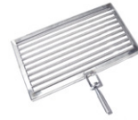
Height adjustable secondary grate