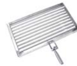
Height adjustable secondary grate.