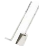
SST shovel & coal rake.